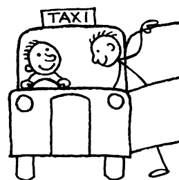
He's getting into a taxi.

Demonstrate two or three examples if necessary.